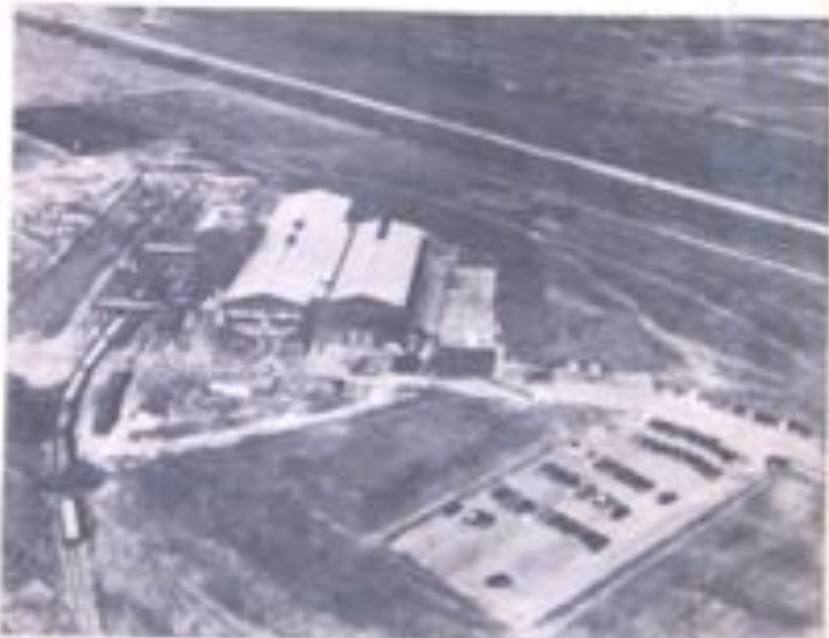
Plant buildings (center) are flanked at right by offices and at left by parking lot.

Congratulations to Lansing on its 100th Anniversary