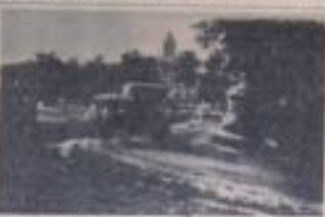
The American Maize Products Company building in Lansing, Michigan, showing the main entrance and the large chimney.