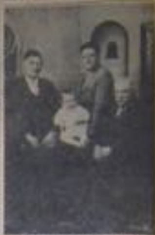
A group of people, including men and women, standing together indoors, possibly in a social or professional setting.

The Lansing Coal Company, established in 1911, is a leading provider of high-quality coal for industrial and domestic use. The company's operations are based in Lansing, Michigan, and it has a long history of serving the community with reliable and efficient service.