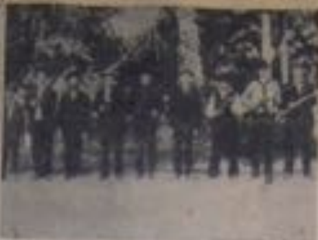
A group of the members of the National Guard, standing in front of the American Maize Products Company building in Lansing, Michigan.

The company's safety record is a testament to its dedication to quality and safety. It has consistently invested in safety equipment and training, ensuring that its employees are always protected. This commitment has resulted in a long and successful history of safe operations.