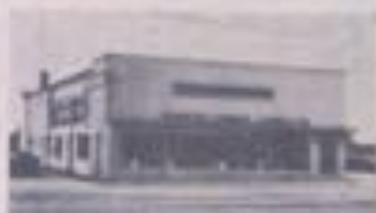
Our headquarters building in Lansing, Michigan.