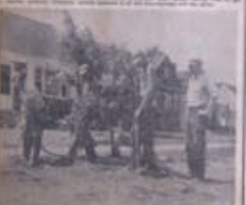
A group of men standing in front of a building, possibly a school or a public building.