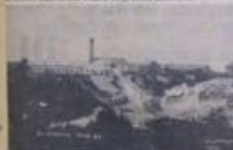
The brick plant at Lansing, Mich., in 1882.

A group of people, including men and women, are gathered in front of a large, classical-style building. They appear to be at a formal event or ceremony. The building has a prominent arched entrance and several windows.