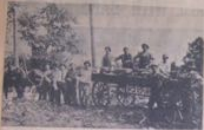
Men with horse-drawn cart in the early days of the lumber industry in Lansing, Michigan.