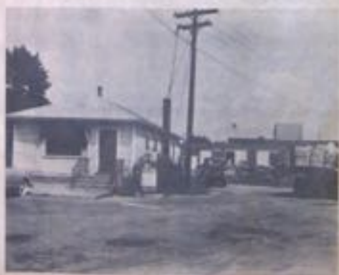
BUILDING LANSING SINCE 1911

Salutes Lansing's 100 YEARS of COMMUNITY PROGRESS