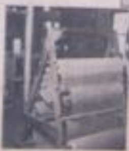
Our sawmill in Lansing, Michigan.

LUMBER, MILLWORK, BUILDING SUPPLIES and COAL