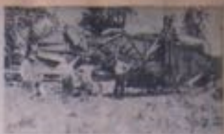
Working under direction by the Pantry Queen Company.

The Pantry Queen Company, which has been producing and distributing olives for many years, has recently introduced a new line of olives in all sizes and shapes. The company's olives are known for their quality and variety, and are available in several different sizes and shapes to suit the needs of different markets.